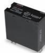
Figure 1.5 the relay

Each electricity switch is equipped with a relay corresponds to the device or the switch that we want to automate using our smart home system, this relay are connected via the twisted pair cable this enables us to operate 7 devices per one cable wire (one for ground) all the twisted pair cables arrive to a central control board that is responsible for managing and controlling the home, its contains a buffer to maintain the status of the device been activated or deactivated. The safe home system management software reads the contents of this buffer to know the status of the entire home.