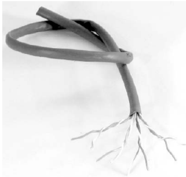
Figure 1.4 typical twisted pair cable

In the smart home system we use UTP type because the cables carries voltage signals to activate the 5 volt relay rather than carrying data see figure 1.5, so interference voltage dose not affect the wiring of the smart home system.