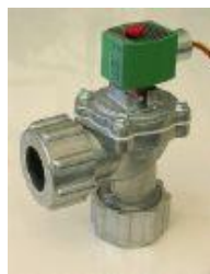
Figure 1.3 Gas control solenoid

Power management system with gasoline generator modified to consume natural gas